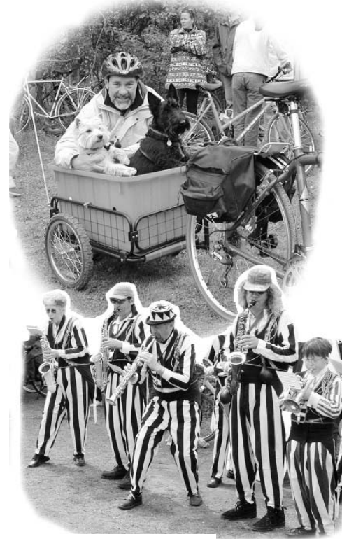
Flashback to fun in the woods at last year's C&W celebration