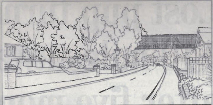
Proposed view looking west along The Bridge Approach